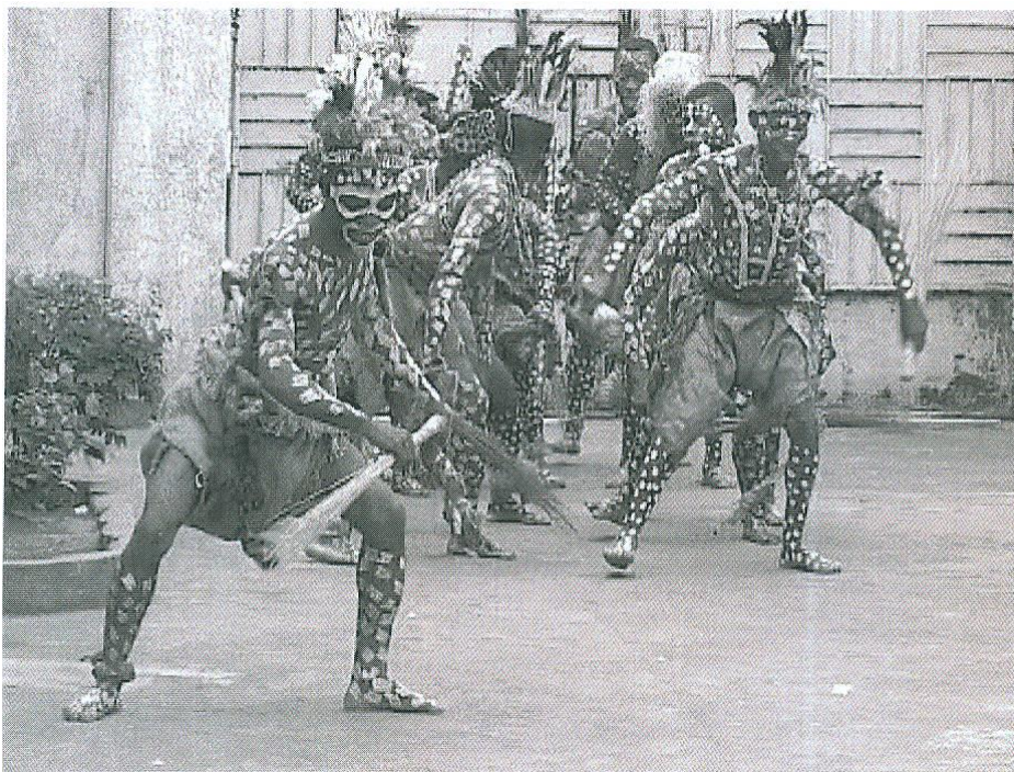
Fig. 1. Ekondas singing and dancing, holding kikombo (brooms).